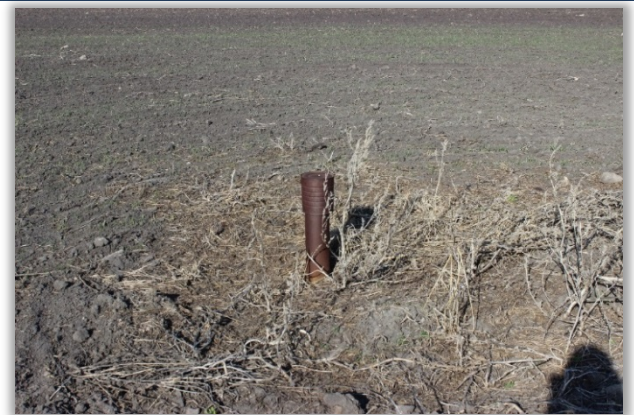
Abandoned well in Marshall County scheduled to be sealed with state funds

The Marshall SWCD is doing better because these funds are readily available. If we are out of limited state cost share funds and United States Department of Agriculture (USDA) funds are not available, we are able to use these funds instead of waiting for more to come available. The quicker a project is completed properly, the more likely the landowner is to do business with us in the future.