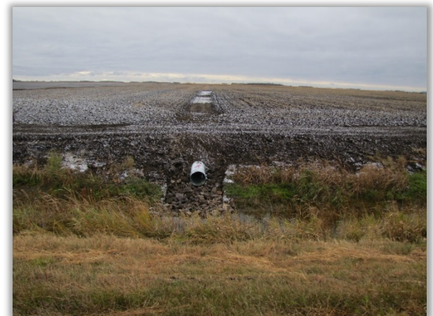
Side Water Inlet (SWI) installed with state funds

CONTACT: DARREN CARLSON MARSHALL SWCD 218-745-5010 DARREN.CARLSON@MN.NACDNET.NET